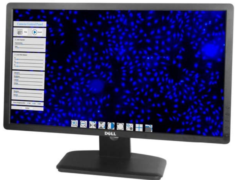
With microscope and monitor