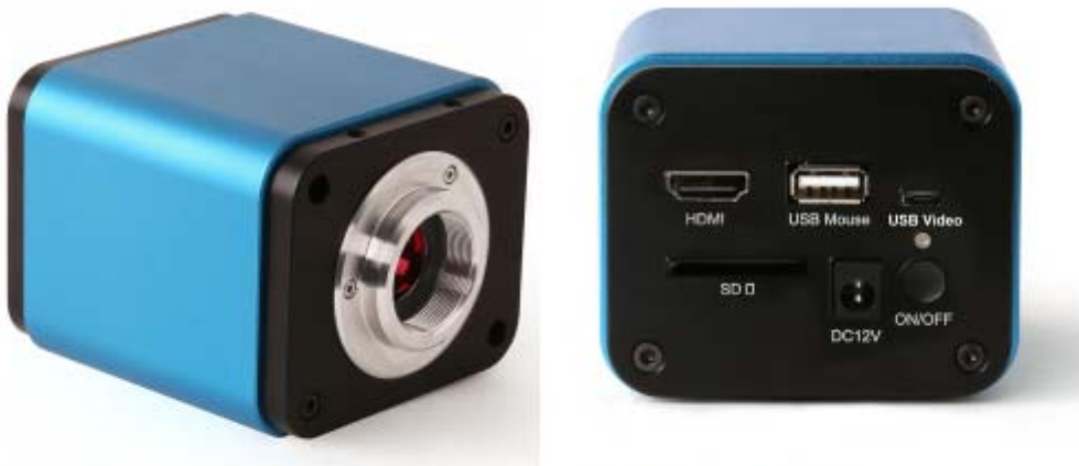
ALPHA1080 Series and Its Back Panel