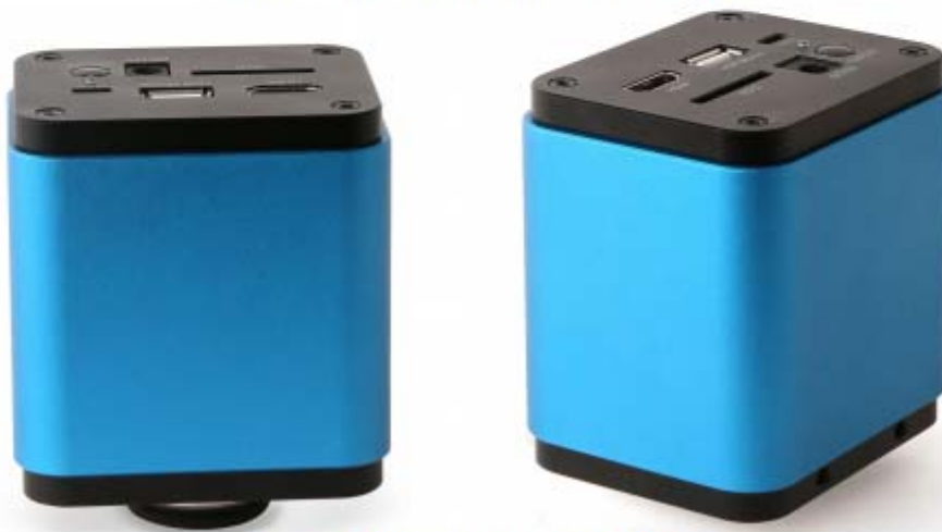
Different Views of ALPHA1080 Series