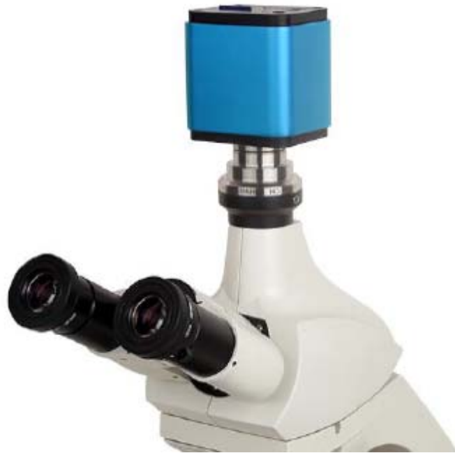
Mounted on microscope